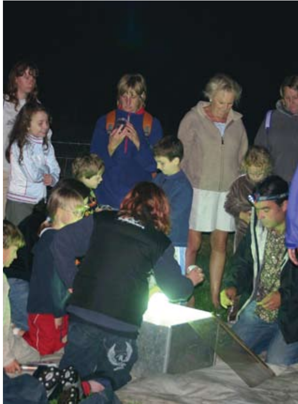
Local families study and identify moths

3. These indicators will be used to assess the implementation of the Strategic Action Plans detailed in Section 7 of the Management Plan and should determine the extent to which the vision, aims and objectives of this bid are met. They will be supplemented with monitoring measures which are being developed in accordance with work done by the World Heritage Coordinators in the UK and that these will be tailored to measure impact of change on the attributes of Outstanding Universal Value identified in Section 3b. They will be undertaken within the 6-year timescale of the World Heritage Convention periodic reporting exercise and guided by best practice.