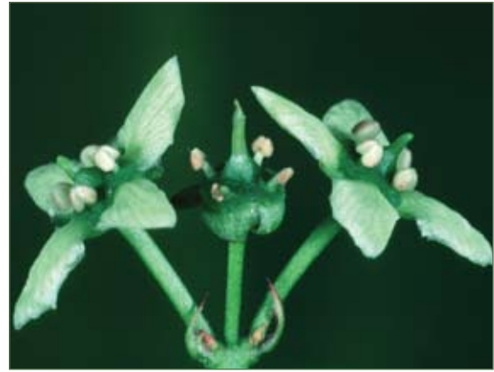
Female Euonymus flower

Darwin studied the forms of the spindle flower on Down Bank (previous page) for his study of the development of sexual differences in plant species