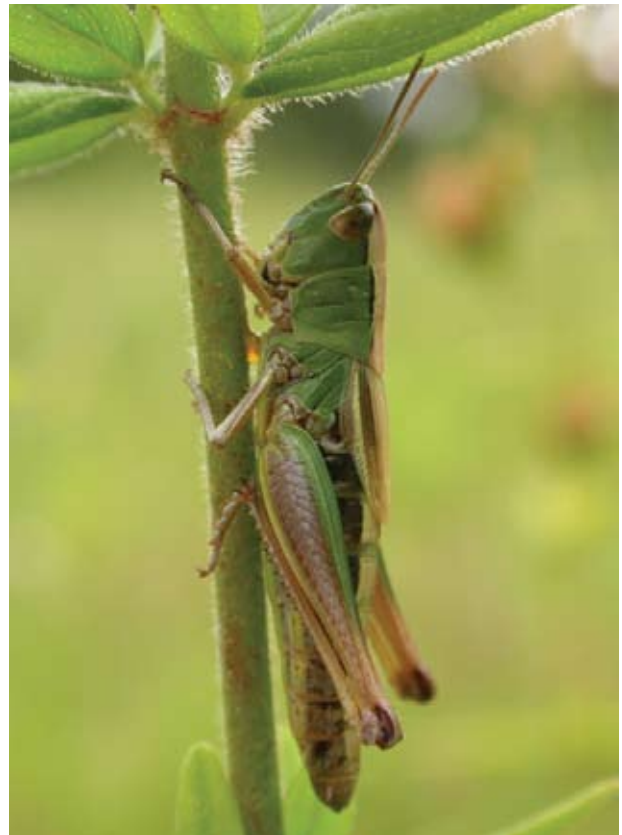
Systems of biological monitoring are in place