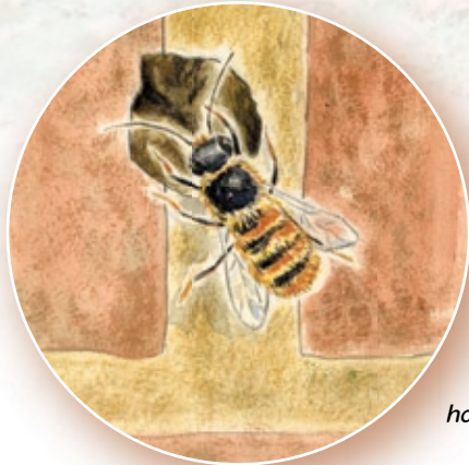
Bee climbing into hole in a wall

Discuss what you see with your walking partners.