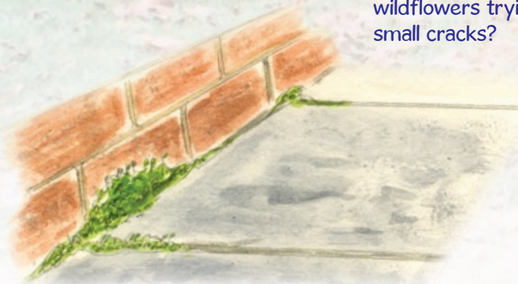
Moss growing at the edge of the pavement